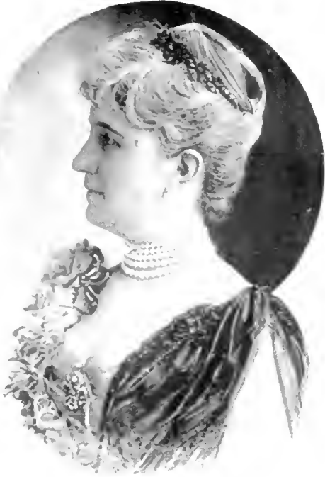
BERTHA HONORÉ PALMER.

Georgetown, D. C. Shortly after graduating, in 1871, she became the wife of Potter Palmer, the Chicago millionaire, and since her marriage she has been the recognized leader of fashion in that city. She has shown her literary talent in essays on social subjects, one of which is "Some Tendencies of Modern Luxury." She is an accomplished linguist and musician and a woman of marked business and executive capacity. She is a member of the Fortnightly Club, of Chicago. She was chosen president of the board of lady managers of the exposition of 1893, and she went to Europe in 1891 on a mission in the interest of the exposition. She succeeded in interesting many of the prominent women of Europe in the fair, and much of the success of the woman's department is due to her work. Mrs. Palmer is a tall, slight, dark-haired and dark-eyed woman, of decided personal and intellectual charms, and a woman of mark in every way. She is a skillful parliamentarian and a dignified presiding officer. Her home is a marvel of artistic luxury.